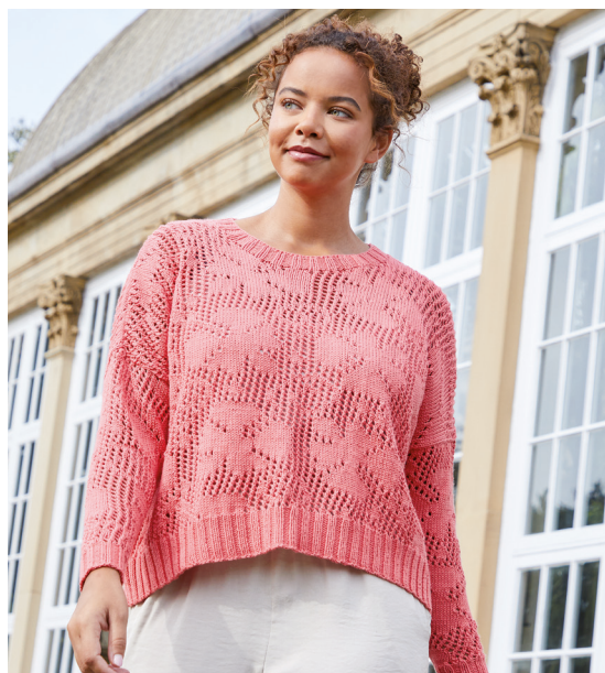
Sample size 91-97 cm (36-38")