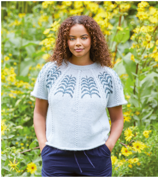
Sample size 91-97 cm (36-38")