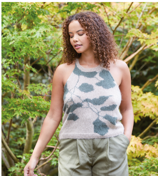
Sample size 91-97 cm (36-38")