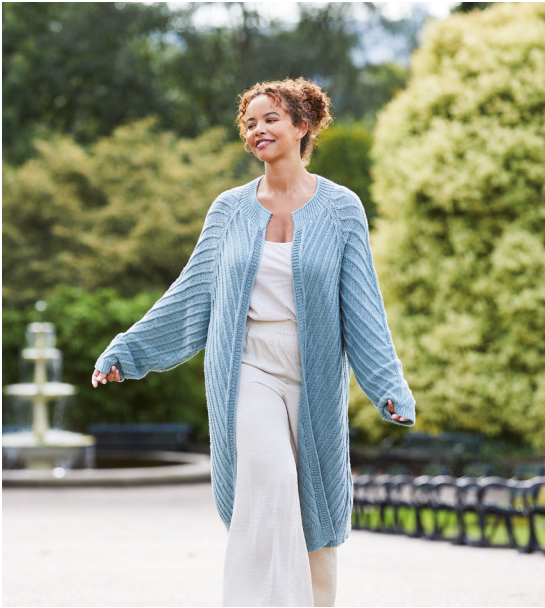
Sample size 86-97 cm (34-38")