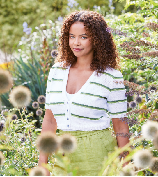
Sample size 91-97 cm (36-38")