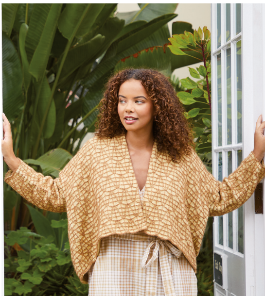
Sample size 86-97 cm (34-38")